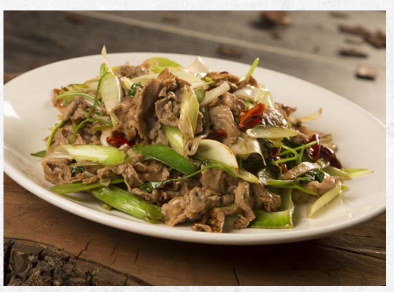
蒜苗爆炒羊肉 (微辣) Garlic Leaves Sautéed Sliced Lamb