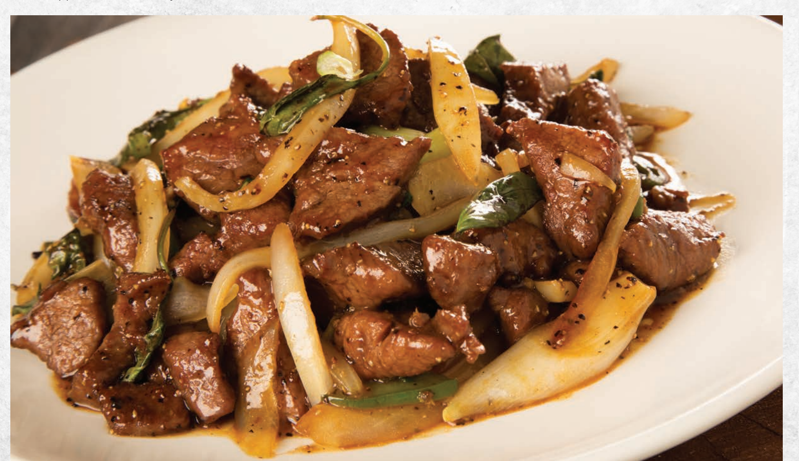
越式牛柳粒 Vietnamese Style Filet Mignon