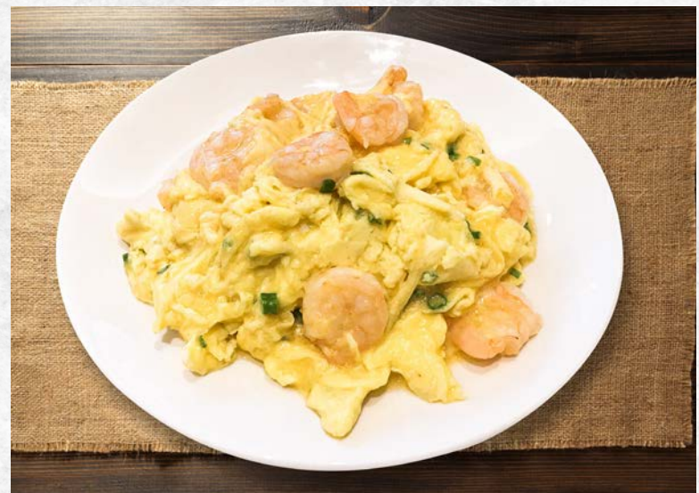
Scrambled Shrimp and Eggs