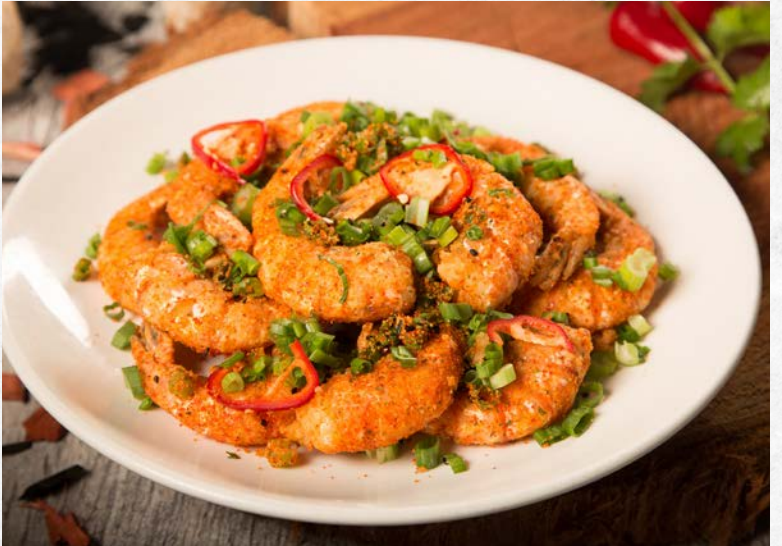
椒鹽老虎蝦 Pepper Salt Black Tiger Prawns