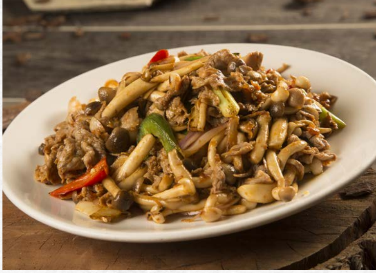
XO Sauce Sautéed Sliced Lamb