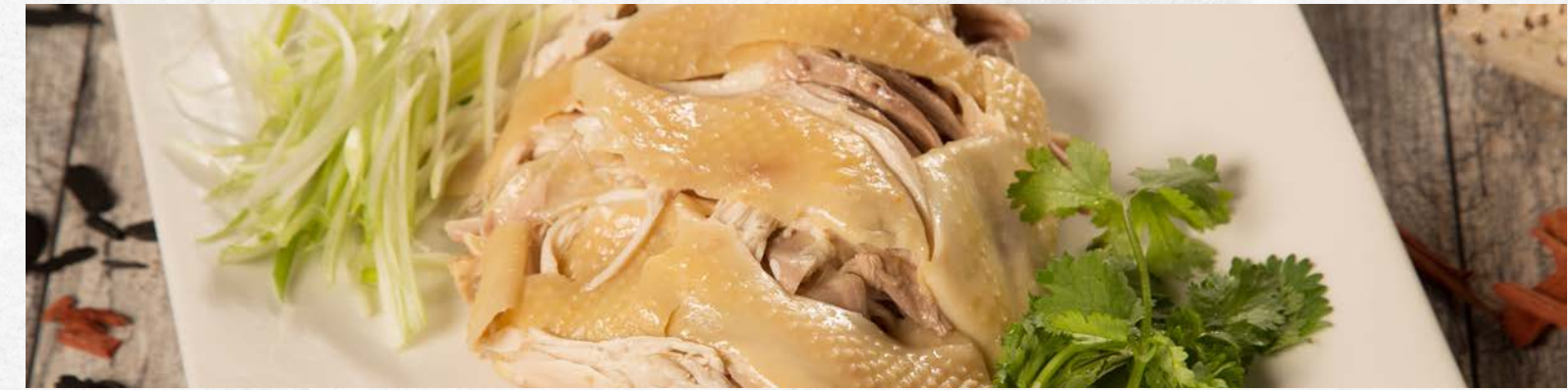
花雕醉雞(黃毛雞)(冷)(半隻) Cold Druken Free-Range Half Chicken