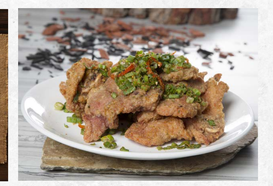
$20.25 椒鹽排骨 白玉菇黑椒牛柳 Black Pepper Filet Mignon with Mushrooms and Honey Peas