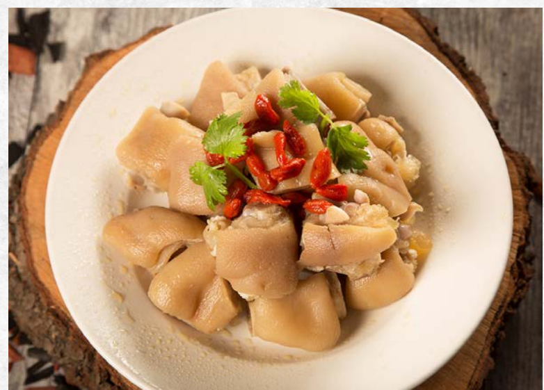
醉豬手 $18.00 Drunken Pig Feet