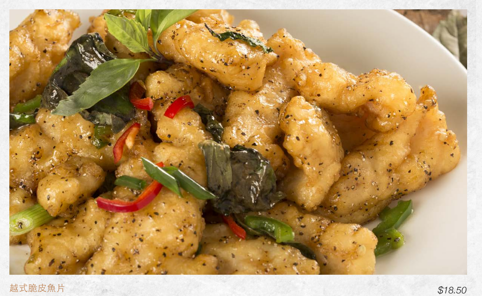
越式脆皮魚片 Black Pepper Vietnamese Style Fried Fish with Basil