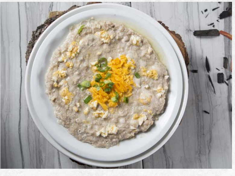
鹹魚鹹蛋蒸肉餅 $17.50 Steamed Pork Meat with Salted Fish and Egg