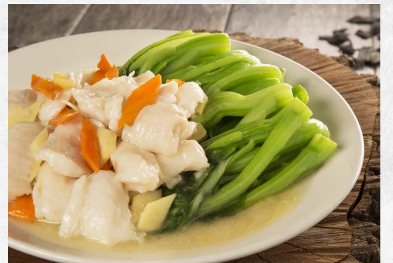
時菜炒斑片 Fish Fillet with Seasonal Vegetable Stir Fry