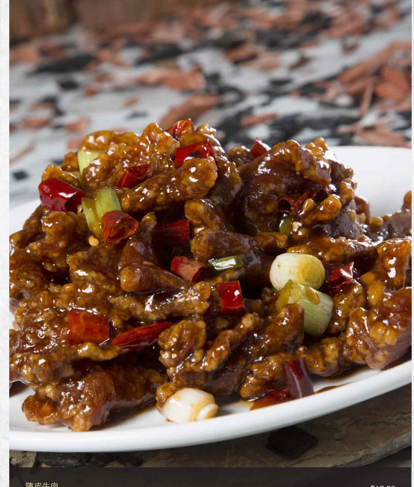
陳皮牛肉 Orange Beef