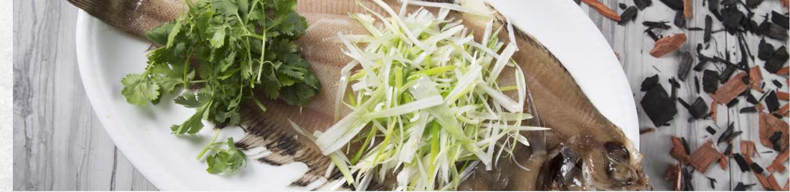
清蒸原條龍利 Steamed Whole Sole