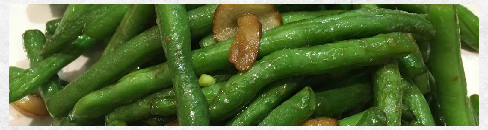
蒜蓉四季豆 Garlic String Beans Stir Fry