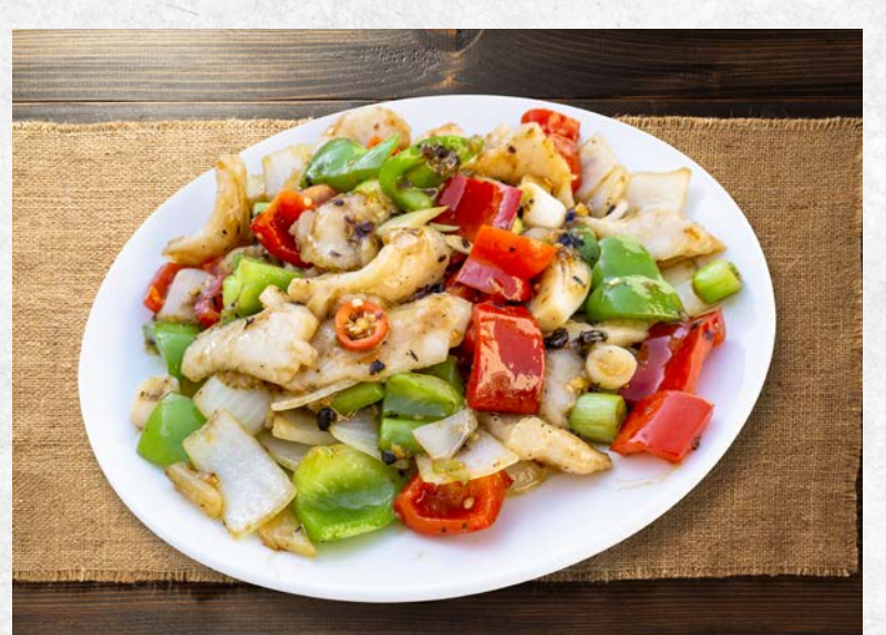
豉椒斑片 Black Bean Sautéed Fish Fillet