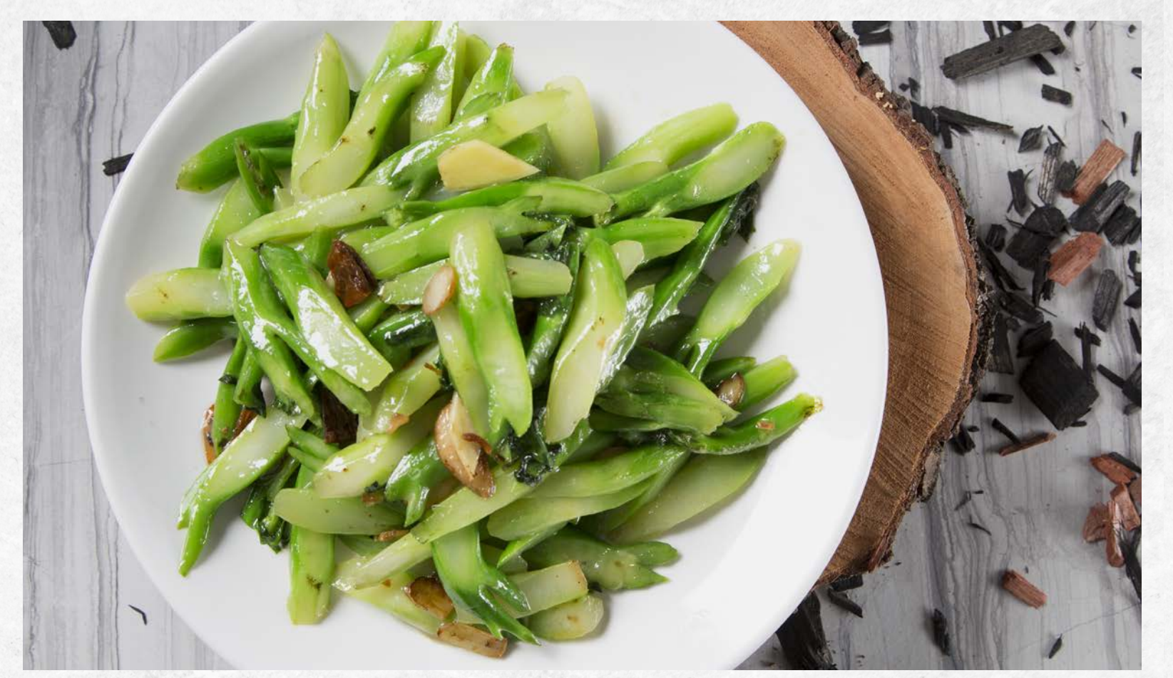
大地魚炒芥蘭 Dried Fish with Chinese Broccoli Stir Fry