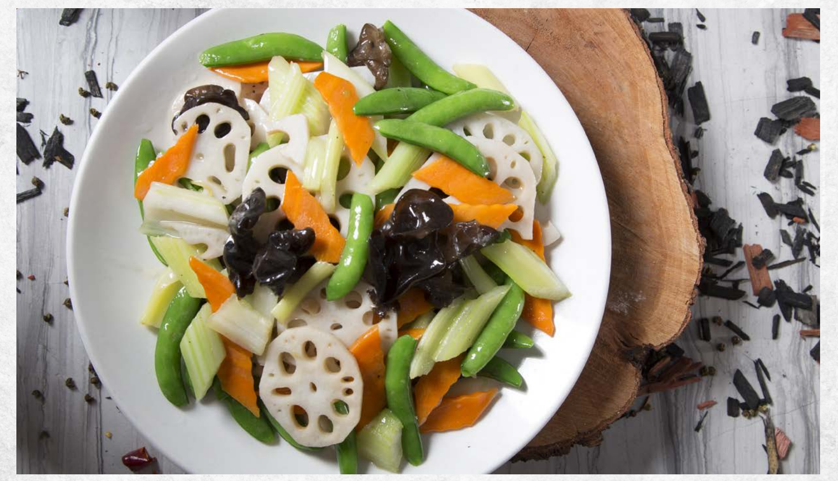
蓮藕小炒王 Lotus and Wood Ear Stir Fry