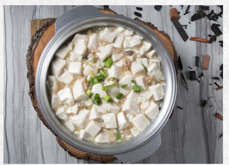
鹹魚雞粒滑豆腐 Salted Fish, Chicken and Tofu Hot Pot