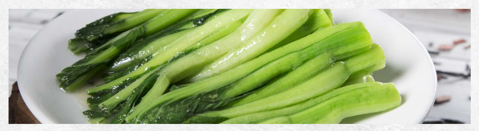
清炒菜心 Plain Soy Chum Stir Fry