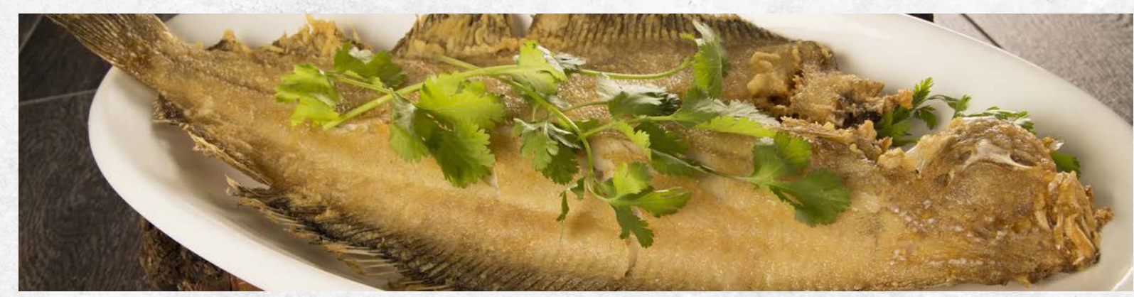
酥炸原條龍利 Deep Fried Whole Sole