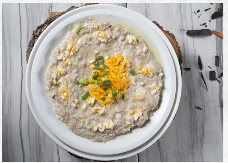
鹹蛋蒸肉餅 Steamed Pork Meat with Salted Egg